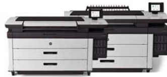
HP PageWide XL 5000 Printer series Powerful, efficient monochrome and color production