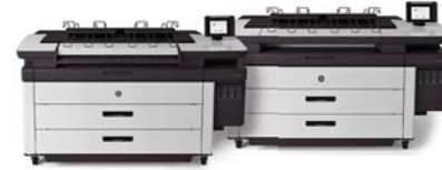
HP PageWide XL 4500/4000 Printer series Do the work of two printers with one—faster 11