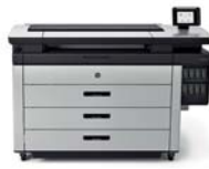
HP PageWide XL 8000 Printer series The fastest large-format printer ever, monochrome and color 1