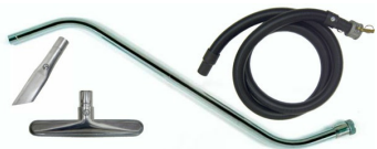
Ø1.5" (Ø38mm) Static Dissipative Tools and Accessories - Included