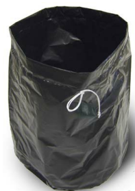
Conductive Polyliner Recovery Bag - Included