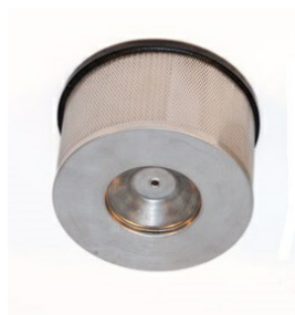
Upstream HEPA Filter - Included