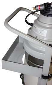
C-10EX DT (MFS) Tool Basket