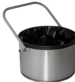
C-10EX DT (MFS) Recovery Tank and Poly Liner