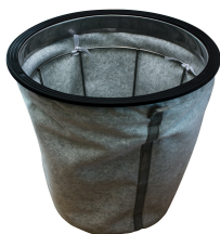
Main Cloth Filter and Cage, Static Dissipative - Included