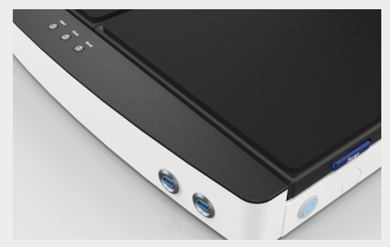
Store images directly to any USB devices via the USB 3.0 ports

Scan2Pad<sup>®</sup> wireless hotspot. Upgrade to Professional. Batch Scan Wizard Pro License. Background OCR on scanner. Full Coverage Warranty, up to 5 years of free spare parts and consumables.