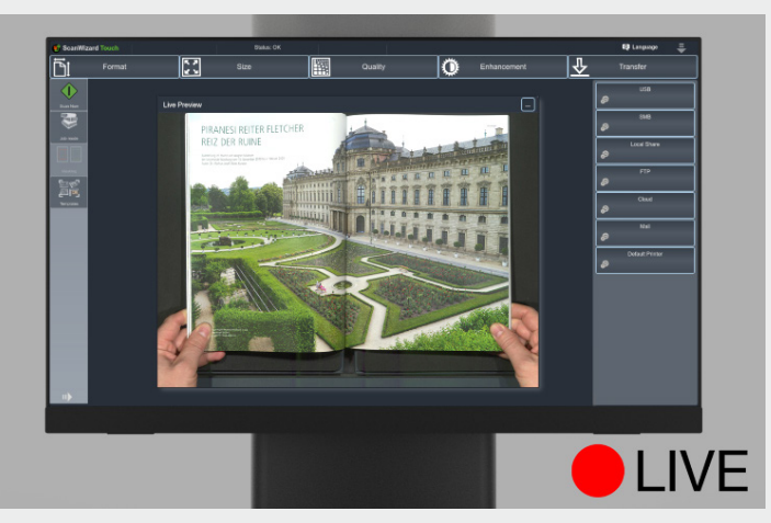
Live preview camera to optimize document position before scanning

Bookeye is the eco-friendliest scanner on the market, consuming only 1.5W in standby. Its high quality LED lamps only light up when needed, saving even more energy.