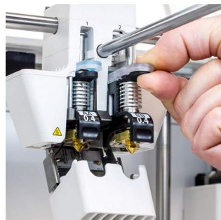
Print core BB Quick-swap nozzles for build and water-soluble support materials. Available in 0.25, 0.4, and 0.8 mm