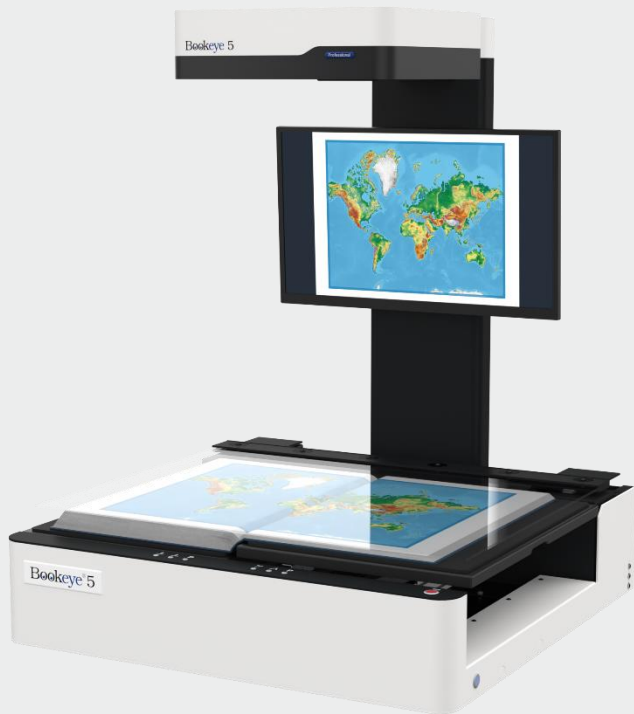
The Bookeye® 5 V1A with V-shaped book cradle and motorized glass plate

Before a new book is scanned, the lift motor lowers the glass plate onto the book until the desired pressure is reached. The pressure is measured highly accurately, and it can be up to 10kg / 22lbs under operator control. Once the book's thickness is programmed into the lift mechanics, the scanner only needs to open and close the scanning glass to allow for book page flipping. The borderless glass plate opens automatically after each scan to the user defined angle. The speed at which the glass plate opens and closes is also user adjustable.