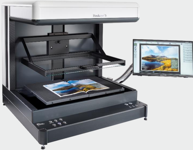
Horizontal self-adjusting book cradle with flat glass plate

The motor-driven V-shaped glass plate enables perfect scans while protecting the book binding. The balanced design allows effortless scanning without any physical effort. For exact positioning on the book fold, the V-shaped glass plate is moved horizontally. Depending on requirements, the Bookeye® 5 V2S Semiautomatic can be used with a flat glass plate or without a glass plate at all.